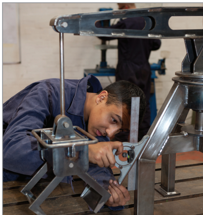
Apprentice working on a crane to showcase at the World Skills Olympics

The future looks bright for WEC Group Ltd. 2011 will see the company consolidate all the Group's businesses under four main umbrellas: WEC Fabrication, WEC Laser, WEC Machining and WEC Camera Mounting Solutions. The introduction of WEC Rail will also enable the Group to provide a one-stop-shop for the rail industry.