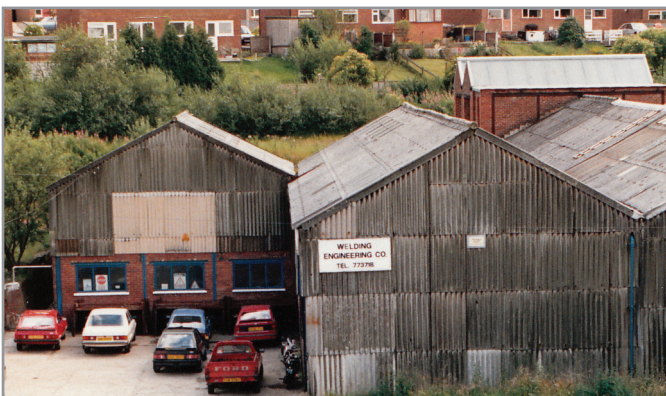
The Group's second site at Cranberry Lane, Darwen

Business was steady and by 1983 expansion was due. A fire at the plastics factory next door spurred the pair on to purchase a larger site on Cranberry Lane, Darwen. At a cost of £10,000, the business, now employing four people, moved to the 10,000 square foot, semi-derelict site, which required major work, but was just about affordable.