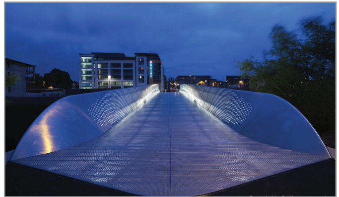
Mead's Reach Bridge, Bristol, fabricated by m-tec, our division which specialises in stainless steel architectural pieces

Over the next eight years, business grew from strength to strength and in 1987, the business became a limited company.