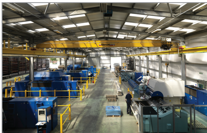
The Technology Centre, built to house the latest in laser cutting technology

The Group also committed to a three year sponsorship of their local football club, Blackburn Rovers, to increase awareness and encourage recruitment from within the local area.